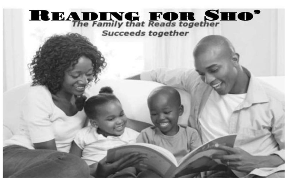
Every 1st Sunday of the Month @ 3 PM Smooth Living, 1263 Winchester Road

Monday 6:00pm Thursday 6:00pm at 6077 Apple Tree Drive – a balanced approach to personal development – Faith, Family, Fitness and Finance